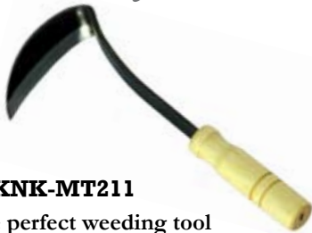
KNK-MT211 The perfect weeding tool reaches into tight spots