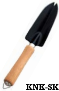
KNK-SK512D Sharpened v-tip for weeding and transplanting