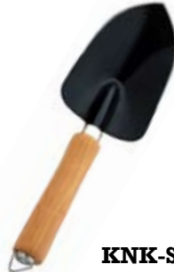
KNK-SK511A Wider blade for easy potting and planting