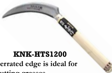
KNK-HTS1200 Serrated edge is ideal for cutting grasses