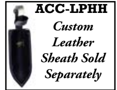
ACC-LPHH Custom Leather Sheath Sold Separately

The essential gardening tool! Serrated edge for sawing, sharpened tip and edge for planting and weeding, and beveled with depth measurements for digging and planting. Vinyl Sheath included.