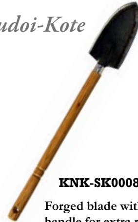
KNK-SK0008 Forged blade with longer handle for extra reach and back relief

These shovels all feature specially sharpened blade-like edges to make cutting through soil, roots, and weeds easier and faster. The edges are hardened to stay sharp longer and the tools are designed to be lightweight and extremely durable.